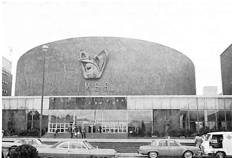
The Mexican Social Security Medical Centre where the 38th General Assembly Session was held.