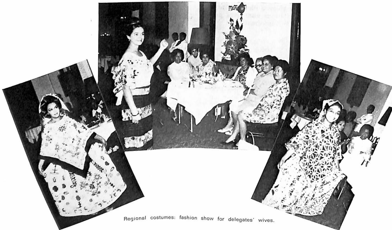
Regional costumes: fashion show for delegates' wives.

Delegates who chose to stay in Mexico City were able to enjoy a lively Mexican lunch, preceded by a „charreada” a sort of rodeo in which fine horsemen riding spirited thoroughbreds have to perform numerous spectacular and perilous feats of daring, such as lassoing young bulls or wild horses. The richly embroidered costumes, the widebrimmed “charro” hats, the noise and movement, the dashing horsemen, and the enthusiasm of the crowd who, when delighted by a particularly clever feat, throw their hats into the arena to show their appreciation, all this helped to make the afternoon a picturesque and colourful occasion and a fitting end to the 38th General Assembly session which will remain in the minds of all as a conference marked by the elegance, culture, modernism and most of all the hospitality of our Mexican hosts.