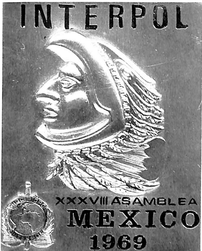
The hand-engraved badge presented to delegates in Mexico City.

From 23rd to 26th June, a seminar on the use of electronic data processing in police work had been held at the General Secretariat. It had been attended by 80 experts from 27 countries. Discussions had concentrated mainly on the application of electronic data processing purely police problems. It had been suggested that the various codes used by different countries should be centralised at the General Secretariat and made available to interested countries on request. The participants had urged the Secretariat to publish a report on the computerisation programmes which were planned or already functioning, notably with regard to active police work.