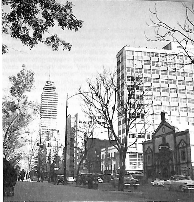
The Latin-American tower from the Alameda Park.

(Editor's note: Three countries submitted reports on drug traffic to this Committee: the Lebanese delegation submitted the report "Introduction of worthwhile crops to replace cannabis", the Mexican delegation submitted a report on the relationship between licit and illicit drug traffic in Mexico, and the Swedish delegation submitted a report on measures taken by the Swedish Police.)