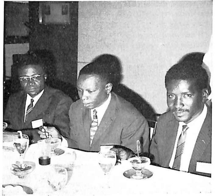
Delegates of the new member countries: on the left, the delegate of Mauritius and, on the right, the delegation of Mali (see opposite page).

provements" which later prove to be liabilities. The many restrictions imposed on society — from ridiculous fashions to endless sales promotion of perfectly superfluous products — are in the process of doing away with the remains of what was once a community. And all this at a time when human society (which is ever increasing in size) is in such need of community spirit.