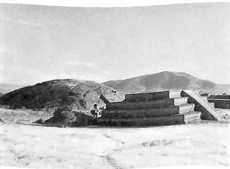
Teotihuacan: the Temple of Quetzalcoatl.

The ancient legends attached to Teotihuacan were recounted in a “son and lumière” show which delegates attended before savouring the delights of an “ambigu” — a typical Mexican meal — with the now melancholic, now frenzied music of the Mariachis — those bands of singers and musicians without which no Mexican reception is complete.