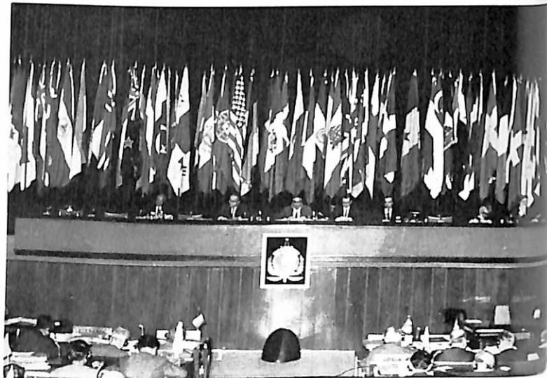
The official platform.

Several countries stressed the importance of having police officers who were cool-headed and experienced . Many others recommended that better instruction should be given in the technical methods for arresting offenders, that marksmanship training should be improved and, most important of all, that more care should be taken over the recruiting of officers . Three countries even suggested that Interpol should draft an "ideal" set of regulations.