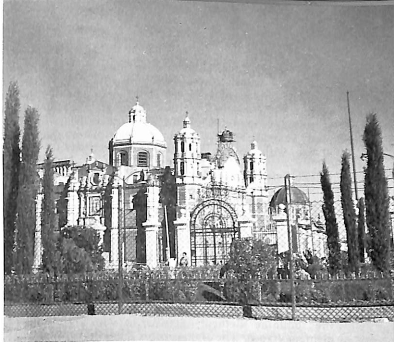
The Basilica of Guadalupe.

Those who chose the weekend in Taxco did not regret it. Taxco, whose original name was Tlacho ("town where they play ball") is 100 miles from Mexico City on the road to Acapulco. This old name is a reminder of the importance of these "games" for the Aztecs; in fact, they were not really games but ritual ceremonies in which the losers were sacrificed according to well-defined rules.