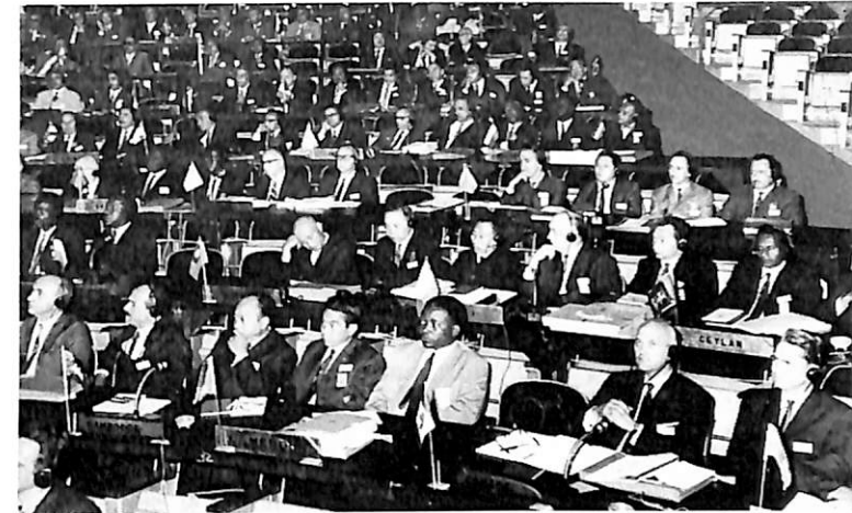
View of part of the conference hall.

Two exceptional contributions had been paid during