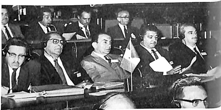
The Mexican delegation.

This part of the world continued to be an important centre for producing opium, morphine and cannabis, and for supplying certain countries in the region (e.g. Iran, U.A.R., Syria) and Europe. There was one im-