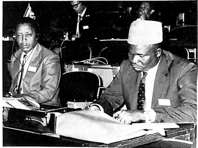
The delegates of Anzania (left) and Chad (right).

for consecutive 3-month periods of technical and linguistic study. These ventures had involved no undue expenditure.