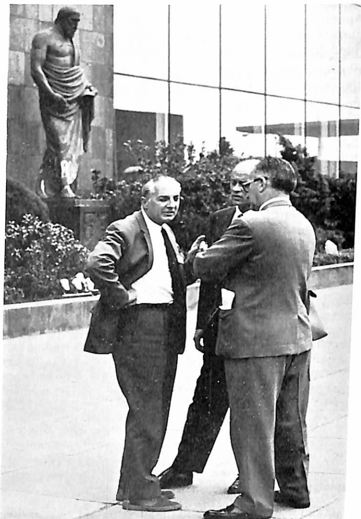
A discussion between sessions.

In plenary session, THE SECRETARY GENERAL recalled that the report had ignored all political aspects of the problem. He drew attention to the series of solutions outlined in the report, from which everyone could derive benefit depending on circumstances and national possibilities.