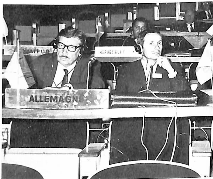
The Federal German delegation.