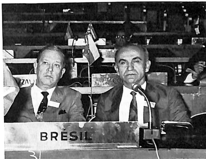
The Brazilian delegation.

visible on a part of the vehicle near that bearing the engine number, but it was repeated on other parts of the vehicle; these locations were always kept secret. In Brazil and the United States car manufacturers changed the location of these confidential numbers every year. He felt the car theft situation would be greatly improved if the General Secretariat were to receive and circulate the list of these numbers to all